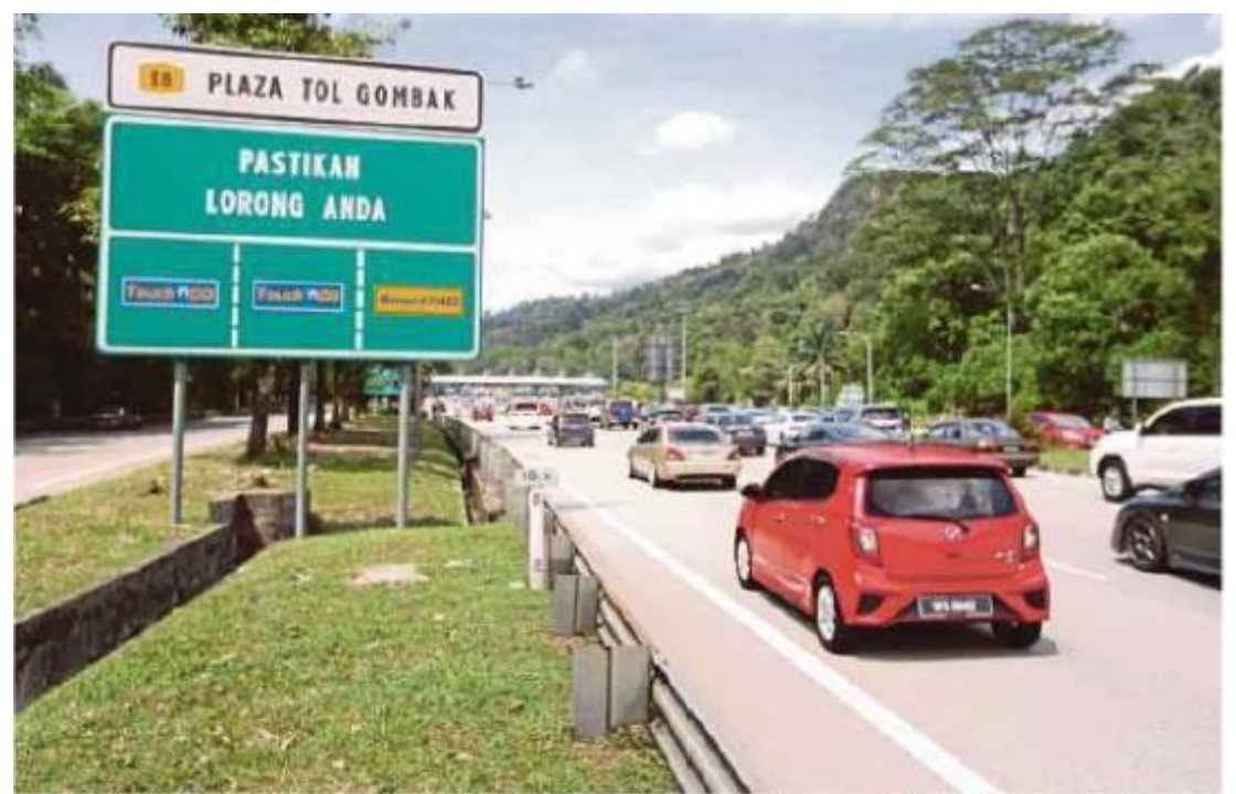
Traffic heading towards the Gombak Toll Plaza from Kuala Lumpur yesterday.